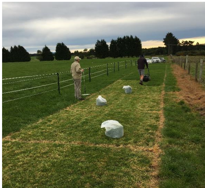
Mowing each plot and collecting the respective plots pasture grown.