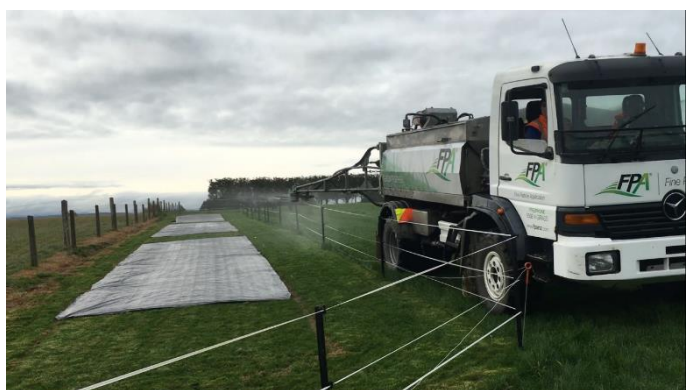
The FPA truck applying FPA60 over the demo plots showing covers in place to shield the remaining plots

To ensure the FPA spreading truck is properly calibrated, covers are laid down to protect the plots that do not require FPA treatment. These covers (including the FPA30 plot covers) are carefully lifted and taken to the workshop to be dried out. Once dry, the fertilizer is swept up and weighed to measure the weight of the fertilizer applied.