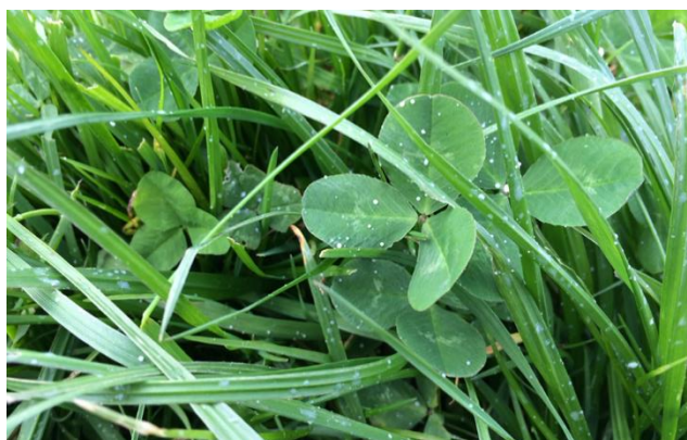
Fertilizer on pasture following FPA application